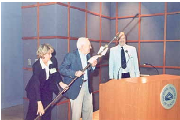
Figure 1. Photo of Dr. Julius Axelrod of the National Institute of Mental Health presenting an authentic poison dart blowgun to John W. Daly on the occasion of his 65 th birthday symposium in Bethesda, MD (June, 1998).