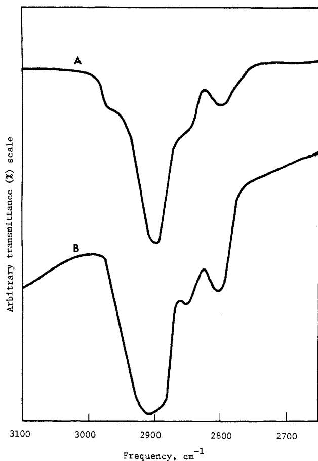
Figure 1.—Infrared spectra: (A) (\text{CH}_3)_2\text{NPF}_2 , neat, gas phase (10 mm pressure); (B) \text{CoBr}_2[(\text{CH}_3)_2\text{NPF}_2]_3 , Fluorolube mull.

The infrared spectrum of \text{CoI}_2[(\text{CH}_3)_2\text{NPF}_2]_3 mullied in Fluorolube has been obtained in the region 4000–2000 \text{cm}^{-1} . As can be seen from Figure 1, the absorptions