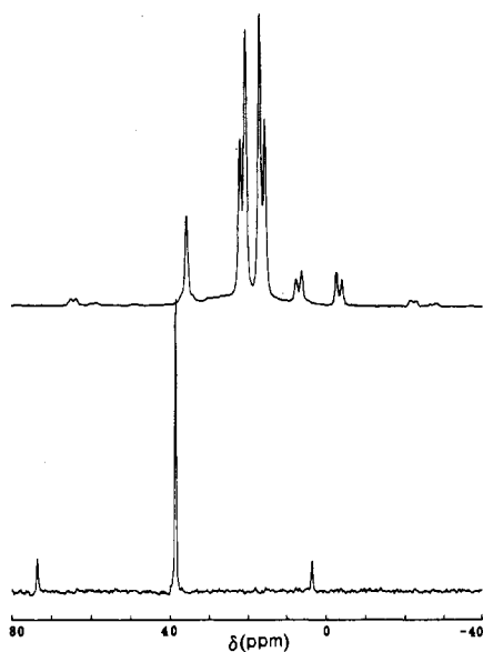
Figure 1. 31 P CP-MAS NMR spectra of Hg(CN) 2 (PPh 3 ) 2 (upper trace) and Hg(NO 3 ) 2 (PPh 3 ) 2 . The effects of the lower symmetry of the cyano complex are clearly shown. The very small, outermost peaks in the upper spectrum are spinning side bands.

in these complexes, and this is reflected in their generally larger P-Hg-P angles. If the two Hg-P bonds are equivalent by symmetry then their s character can be calculated from the P-Hg-P angle. 15 We have assumed that the phosphines are equivalent although only in the nitrate complex is this strictly true. Results based upon this assumption are presented in Table II.