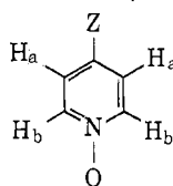
TABLE II N.M.R. OF PYRIDINE N-OXIDES, FREE AND COMPLEXED