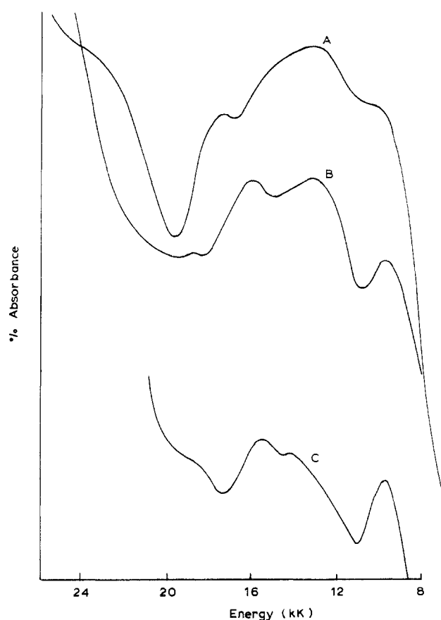
Figure 2.—Diffuse reflectance spectra of ethyldiarsine complexes of niobium tetrahalides: (A) \text{NbCl}_4(\text{C}_2\text{H}_5\text{diars})_2 ; (B) \text{NbBr}_4(\text{C}_2\text{H}_5\text{diars})_2 ; (C) \text{NbI}_4(\text{C}_2\text{H}_5\text{diars})_2 .

As the d_{x^2-y^2} orbital points more directly at the B positions of the dodecahedron than do the other orbitals, changes in the halogen atoms should affect this orbital to the greatest extent. It is experimentally found (Table II) that it is the highest energy band which is most affected by changing the halogen atom in the series \text{NbX}_4\text{L}_2 (where X is Cl, Br, or I, and L is diarsine or ethyldiarsine) as predicted from the above order. The effect of changing the halogen atom on the other two bands is small.