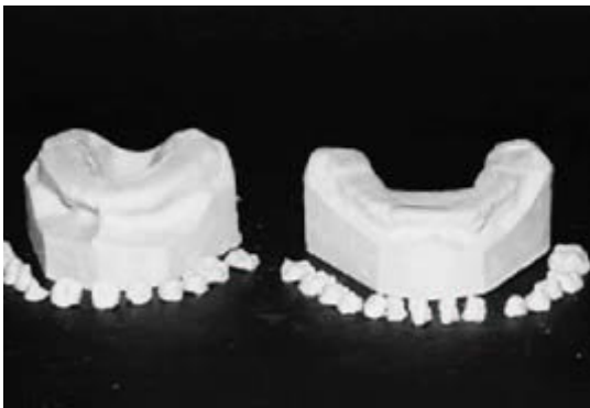
Fig. 4 Teeth broken off for repositioning.