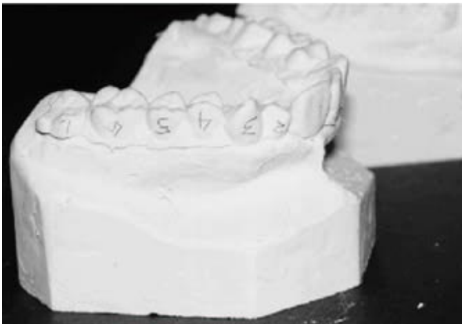
Fig. 3 Teeth numbered on completed setup cast.