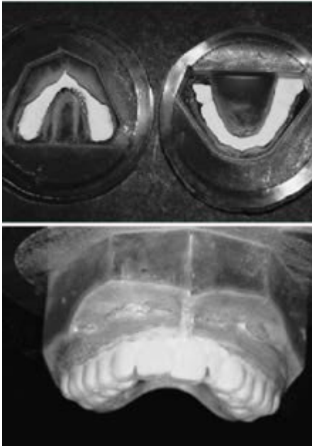
Fig. 2 Orthodontic stone poured in stents to level of gingival margins.