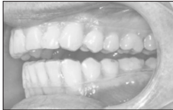
Fig. 2 Upper and lower aligners (trimmed and smoothed for comfort).

Align Technology fabricates a series of the clear plastic retainers, or “aligners”, that sequentially move the teeth at a rate of .25-.33mm every 14 days. The aligners should be worn at least 20 hours per day, but are taken out for meals and for brushing and flossing. The number of aligners needed for a particular case depends on the extent of tooth movement required. I have found that the length of treatment with the Invisalign approach is similar to that with fixed appliances.