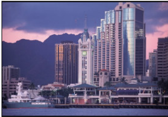
Fig. 2 Honolulu' s skyline as seen from the harbor.