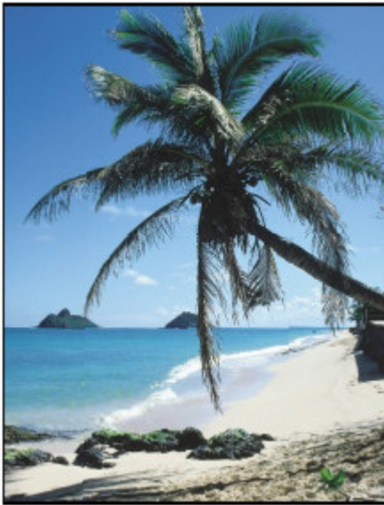
Fig. 4 Lanikai Beach on the island of Oahu.