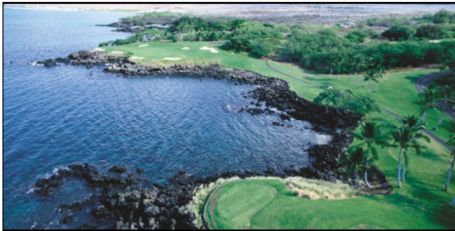
Fig. 5 The signature third hole at the Mauna Kea Golf Course is a long par 3 over the Pacific Ocean.