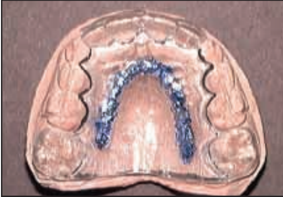
Fig. 7 Completed retainer.