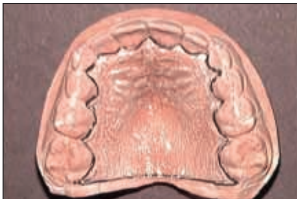
Fig. 4 Palatal layer of Essix material cut off and replaced on cast.

**Dentsply International, Inc., 570 W. College Ave., York, PA 17405.