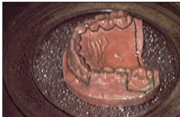
Fig. 3 Green line drawn over Essix material to mark where acrylic is cut from cast.