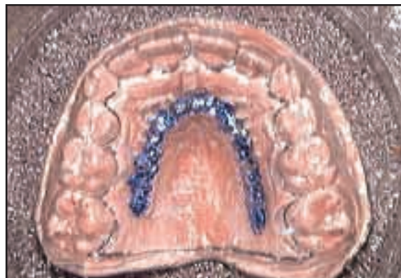
Fig. 6 Second layer of Essix material vacuum-formed over cast.

Seat the retainer in the mouth with finger pressure (Fig. 8). Show the patient how to remove it by pulling down on the incisal material.