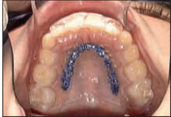
Fig. 8 Retainer seated in mouth with finger pressure.

The retainer should be worn only while sleeping, stored in a retainer case when not in the mouth, and brushed daily with toothpaste. Patients are seen at four-to-six-month intervals, and the palatal material is trimmed as necessary with an acrylic bur in a slow-speed handpiece to allow for bicuspid eruption.