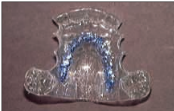
Fig. 1 Theroux Phase One Essix retainer.