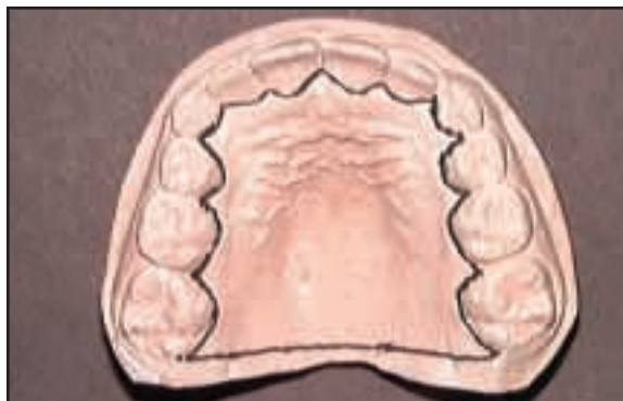
Fig. 2 Black line drawn on cast to mark first palatal layer of retainer.