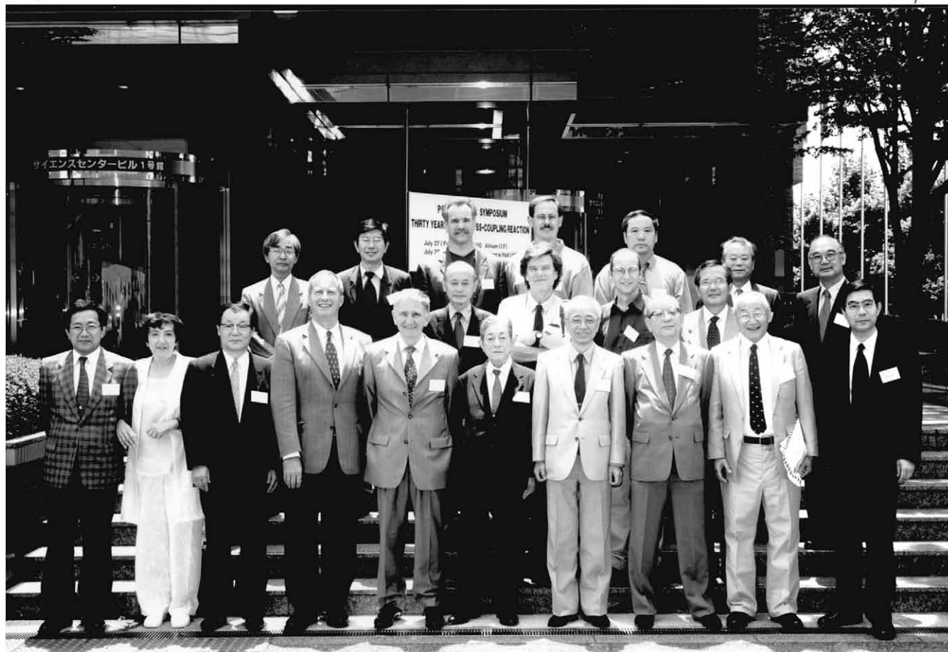
PostOMCOS - II Symposium—Thirty Years of the Cross-Coupling Reaction— July 27 - 29, 2001, Kyoto Research Park, Japan