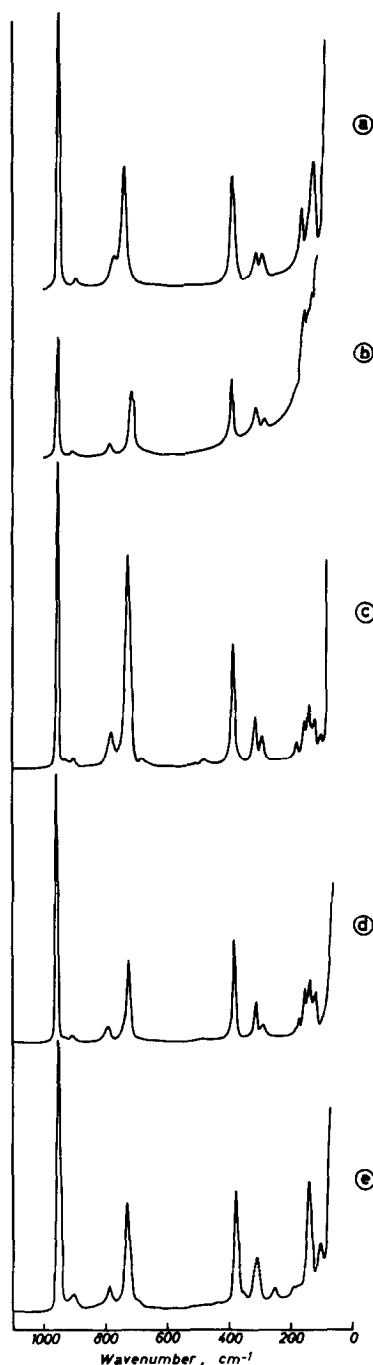
FIG. 2. Raman spectra of CdTeMoO 6 (a), CoTeMoO 6 (b), MnTeMoO 6 (c), ZnTeMoO 6 (d), and MgTeMoO 6 (e).

The solid state reaction of FeMoO 4 and orthorhombic TeO 2 occurs at temperatures higher than 550°C. The X-ray powder pattern of the product obtained at 560°C from