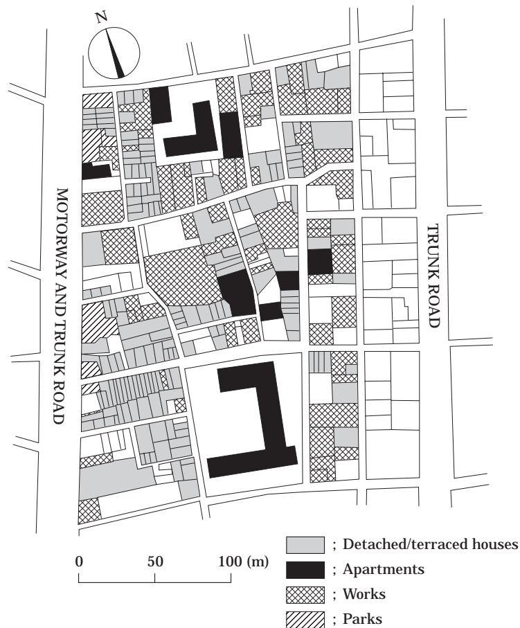
Figure 1. Map of the study area.

Observations of the sonic environment were carried out at midpoints between two junctions of roads. The number of observation points was 44, so that the density of observation points was about seven points/ha. Observations were made over three periods: daytime weekday, night-time weekday, and daytime holiday.