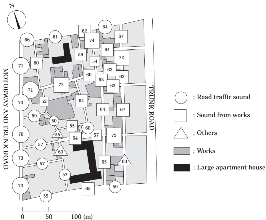
Figure 2. L_{Aeq} measured and the type of dominant sound observed during the daytime on weekdays. Symbols are illustrated at the observation points in the map and the size of the symbol is proportional to the value of the sound level expressed in L_{Aeq} , which is shown in the symbol.

Figure 2 shows the sound level and type of the most dominant sound at each observation point during the daytime on weekdays. Symbols are illustrated at the observation points in the map and the size of the symbol is proportional to the value of the sound level