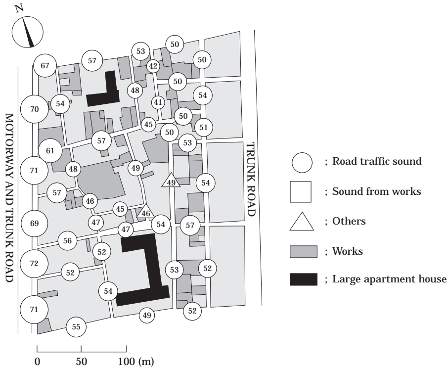
Figure 3. L_{Aeq} measured and the type of dominant sound observed during the night-time on weekdays. Symbols are illustrated at the observation points in the map and the size of the symbol is proportional to the value of the sound level expressed in L_{Aeq} , which is shown in the symbol.

The age of respondents in Group 1, with a median of 57 years, is significantly higher than that of Group 2, with a median of 39 years.