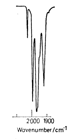
FIGURE 1 Solution i.r. carbonyl spectrum of diequatorial [Mn<sub>2</sub>(AsMe<sub>2</sub>Ph)<sub>2</sub>(CO)<sub>8</sub>]

for the magnetically equivalent arsine ligands and a distorted quartet and triplet for the ethyl resonances in AsEt_{a} .