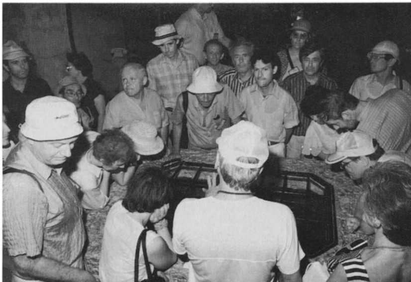
8th ICTA Congress visits the Old City of Jerusalem. The Weill Museum in the Jewish Quarter - Excavations from the period of 2nd Temple

Sunday evening was a "Welcome Reception" where participants enjoyed Israeli wines. Monday evening was dedicated to the chemical industry of Israel. A symposium was organized by scientists from