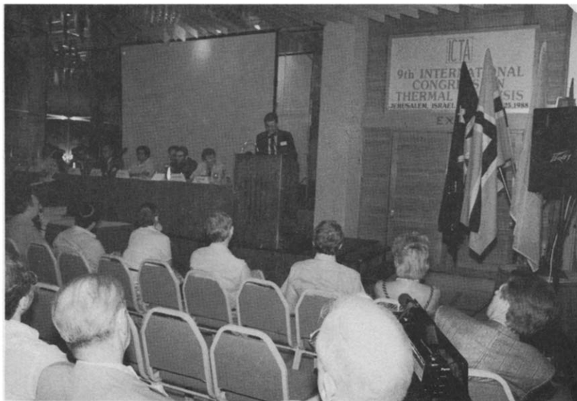
Opening Ceremony

The following Plenary Lectures were presented: