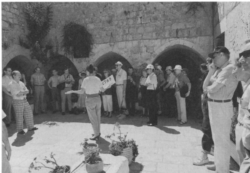
9th ICTA Congress visits the Old City of Jerusalem. King David's Tomb.