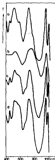
Fig. 2. IR spectra of a. starting hexavanadates, final pro- duct of heating b. K-, c. Rb-, d. Cs-salt

studied substances. However, its composition was not unambiguously identified. This admixture is supposed to be M_{2+x}^I V_6 O_{16} .