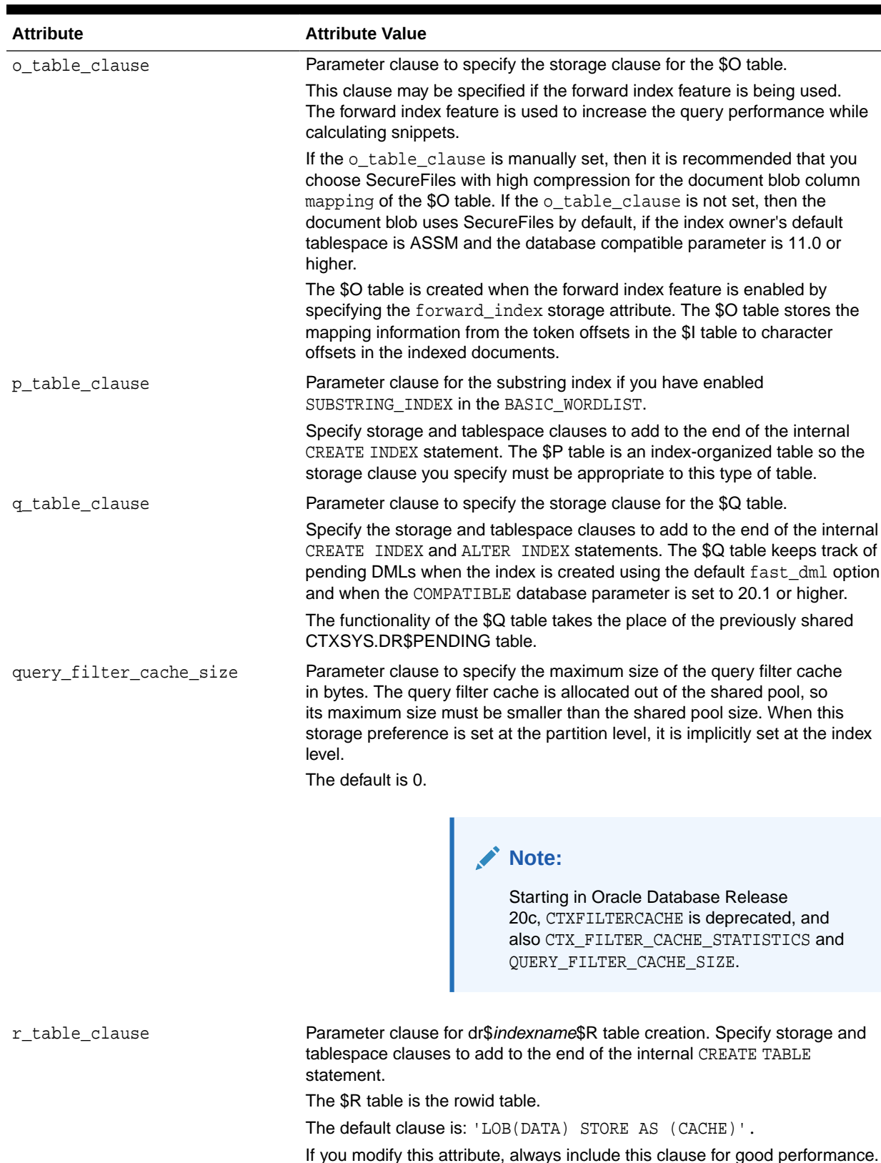
Table 2-41 (Cont.) BASIC_STORAGE Attributes