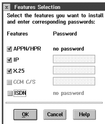
Figure 2. Features Selection