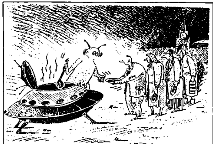
Aleksandr Umyarov Moscow