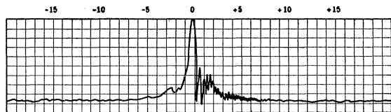
FIG. 2. Proton spectrum at 30 Mc/sec of \text{CH}_3\text{I} enriched with 51 percent \text{C}^{13} with strong 7\frac{1}{2} Mc/sec rf-coupled into the transmitter. The side peaks are almost completely collapsed.

of the peaks give a spin of \frac{1}{2} for the \text{C}^{13} nucleus, verifying the earlier result obtained by Jenkins from hyperfine structure measurements. 6