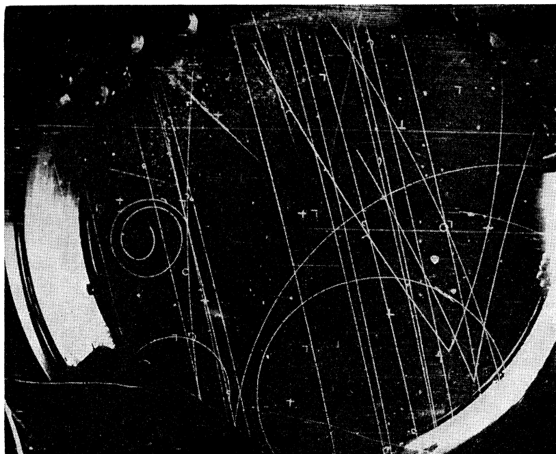
FIG. 1. One of the two stereo views of a double- V event, number 209 909. The left-hand V is a \Lambda of momentum 549 \pm 39 Mev/ c and the right-hand V is a K^0 of momentum 614 \pm 15 Mev/ c . The through tracks are beam \pi^- mesons of 1.12 Bev/ c incident from the bottom of the picture.