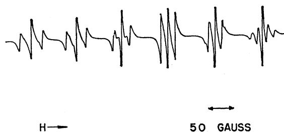
FIG. 2. First derivative of absorption spectrum of \text{Mn}^{2+} in \text{CaO} with H directed along [100] .

local lattice parameters in the vicinity of the impurity ion are not appreciably changed. It is difficult to picture how the trivalent ion can change the local lattice parameters in the same manner as the divalent ion and keep this ratio constant.